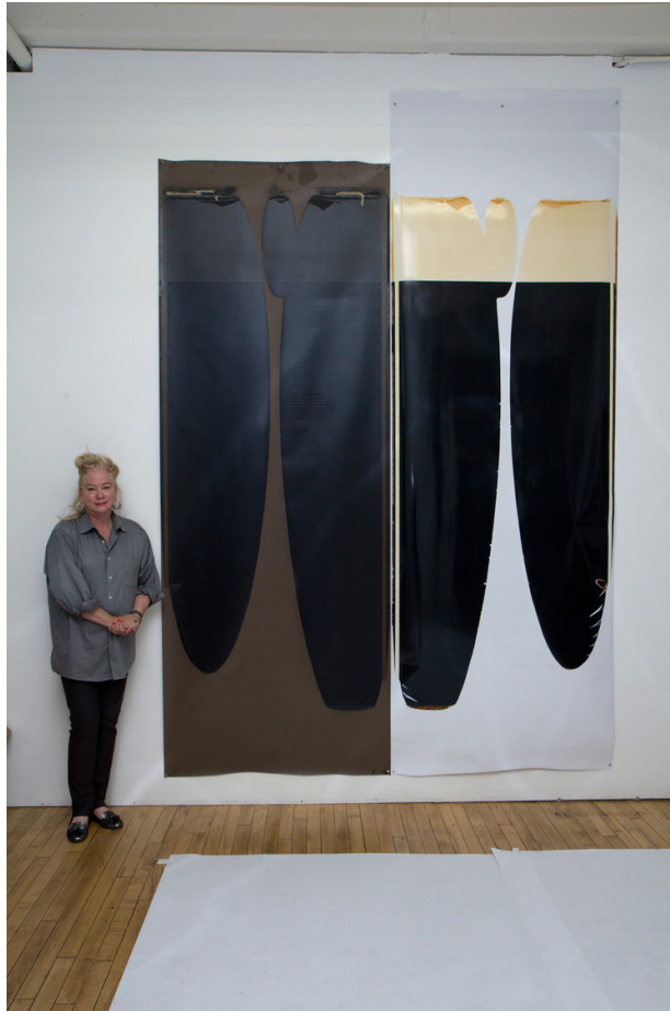
Ellen Carey, 40 x 80 Polaroid Pull XL

single images. Her artworks bring a unique and compelling range of form and hue and high impact compositions in tandem with inventive methods of expression, resulting in bold, innovative, experimental visceral and physical artworks. Ellen Carey also uses her large Polaroid 20x24 camera to create site-specific installations, and is surely one of the most creative and forward-thinking abstract photographers out there.